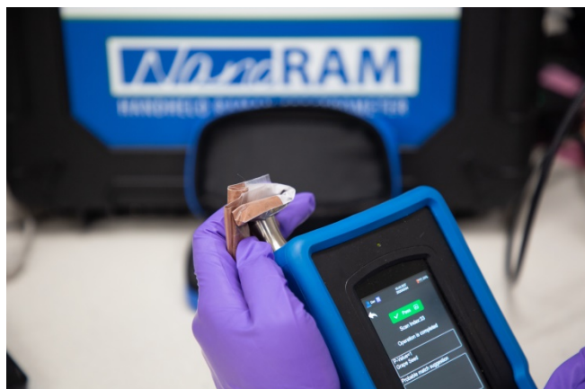
Figure 2. Analyzing Grape seed extract with 1064 nm laser with point and shoot adapter.